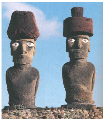
Figure 1 Moai on Easter Island

They were all carved in one big quarry. Initially, the carving of just one moai took years, but by the end of their civilization, the people were capable of finishing a few of them per year. Some weighed 80 tons, twice the weight of the figures at Stonehenge, and they were transported and erected up to 16km from the quarry. The moai were the 'living faces of their ancestors' and each totem looked different to immortalize a particular chief. With their back to the ocean, their eyes of coral segments overlooked and protected the inhabitants from disasters from the outside world.